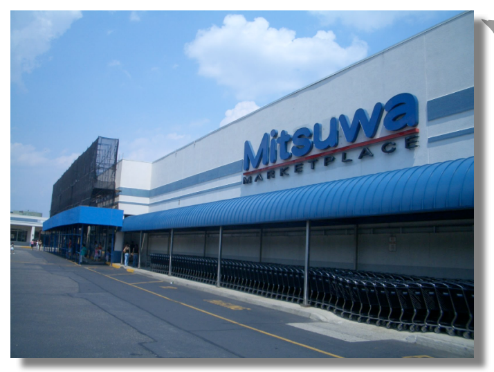
Mitsuwa is a very large supermarket surrounded by various small stores. Next to Mitsuwa are a Japanese bookstore, Japanese cosmetic store, Japanese travel agency and more.

Mitsuwa marketplace offers many aspects of Japanese cultures. From grocery, dairy products, sweets, beverages to asian cuisines at food court, you will enjoy what we have to offer you. There are also Japanese and Asian related specialty stores around the market, and you are sure to be pleased by a breathtaking view of the Hudson River and Manhattan from the food court.