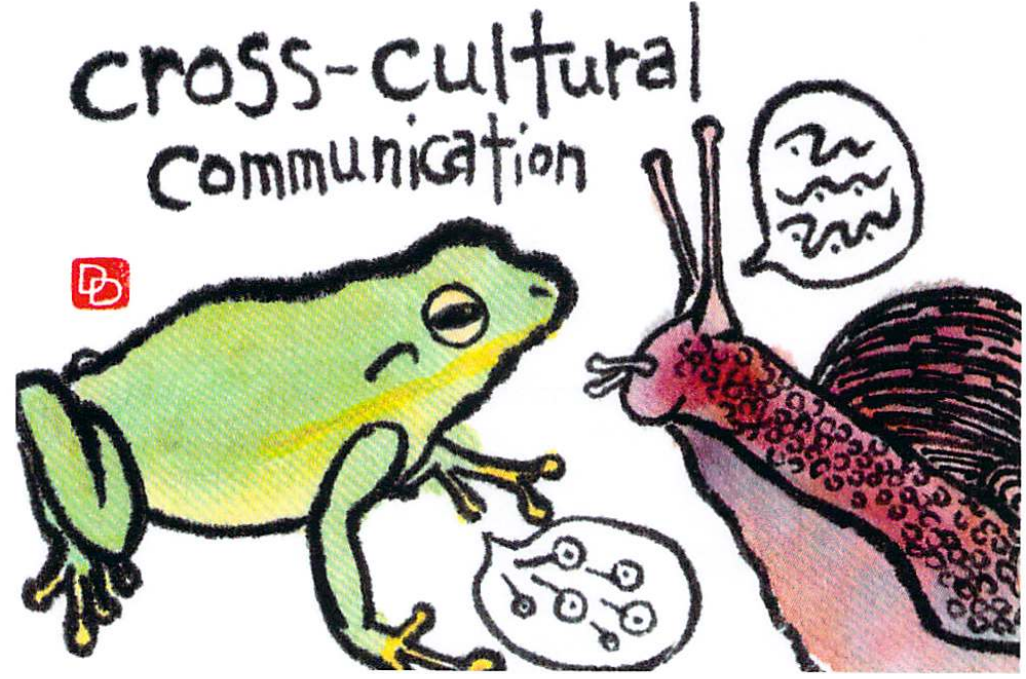
Two examples above are copyrighted by Deborah Davidson. Reprinted with permission.

Tuesday, March 22, 2016 (1:00pm-4:00pm) @ LaGuardia Community College (Room E-500) RSVP: Sign up at <a href="http://bit.ly/lagccEventReg">http://bit.ly/lagccEventReg</a>